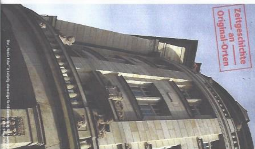
Das „Runde Eck“ in Leipzig: ehemalige Bezirksverwaltung der Stasi

Sonderausstellung „Leipzig auf dem Weg zur Friedlichen Revolution“ Museum in der „Runden Ecke“